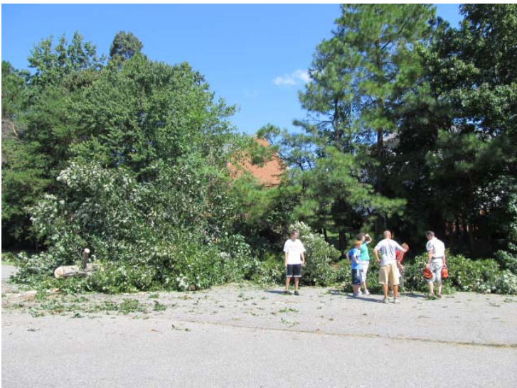
The Embley family helping out a neighbor behind Jones Mill Road