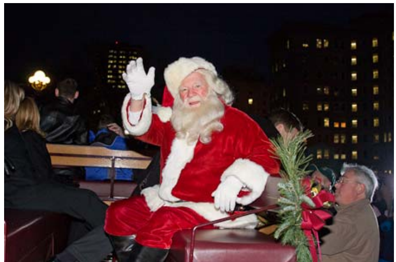
Horse drawn carriage

Please come join us for these wonderful and fun events.