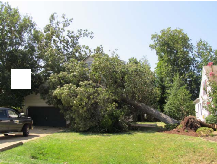
The Enterline's garage (above) and HVAC units uprooted by trees (below).